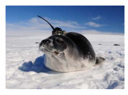
Figure 1: Weddell seal carrying a CTD-SRDL instrument that collects temperature and salinity profiles while the animal is at sea (Credits: D. Costa).

Marine mammals help gather information on some of the harshest environments on the planet, through the use of miniaturized ocean sensors glued on their fur. Since 2004, hundreds of diving marine animals, mainly Antarctic and Arctic seals, have been fitted with a new generation of Argos tags developed by the Sea Mammal Research Unit of the University of St Andrews in Scotland, UK. These tags investigate the at-sea ecology of these animals while simultaneously collecting valuable oceanographic data. Some of the study species travel thousands of kilometres continuously diving to great depths (up to 2100 m). The resulting data are now freely available to the global scientific community at http://www.meop.net. Despite great progress in their reliability and data accuracy, the current generation of loggers is still unable to match standard ARGO quality specifications. Yet, improvements are underway; they involve updating the technology, implementing a more systematic phase of calibration and taking benefit of the recently acquired knowledge on the dynamical response of sensors. Together these efforts are rapidly transforming animal tagging into one of the most important sources of oceanographic data in polar eregions and in many coastal areas.