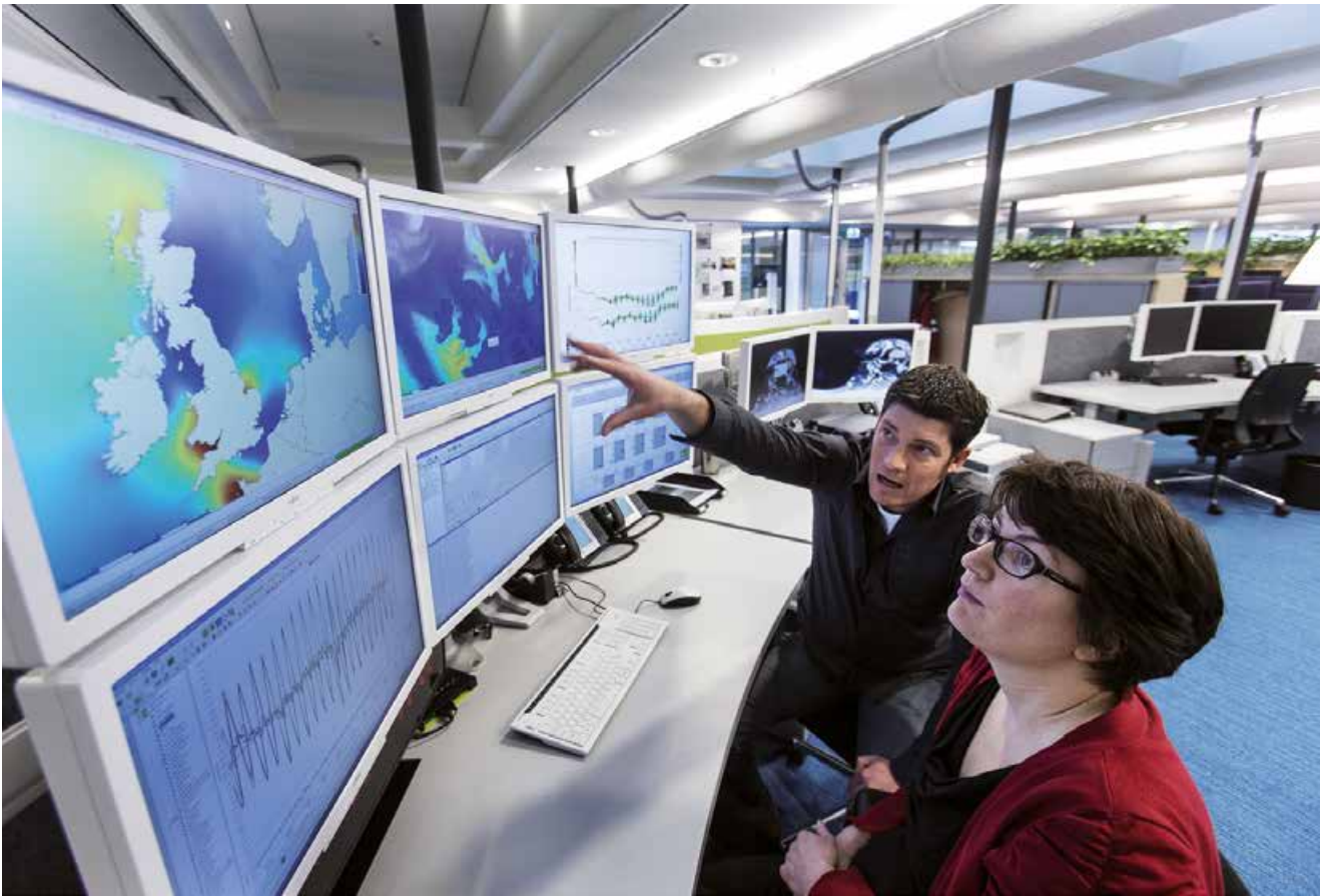
Coastal ocean laboratories, recovering and processing coastal ocean observation data in real time, are key elements to advance science-based coastal management.