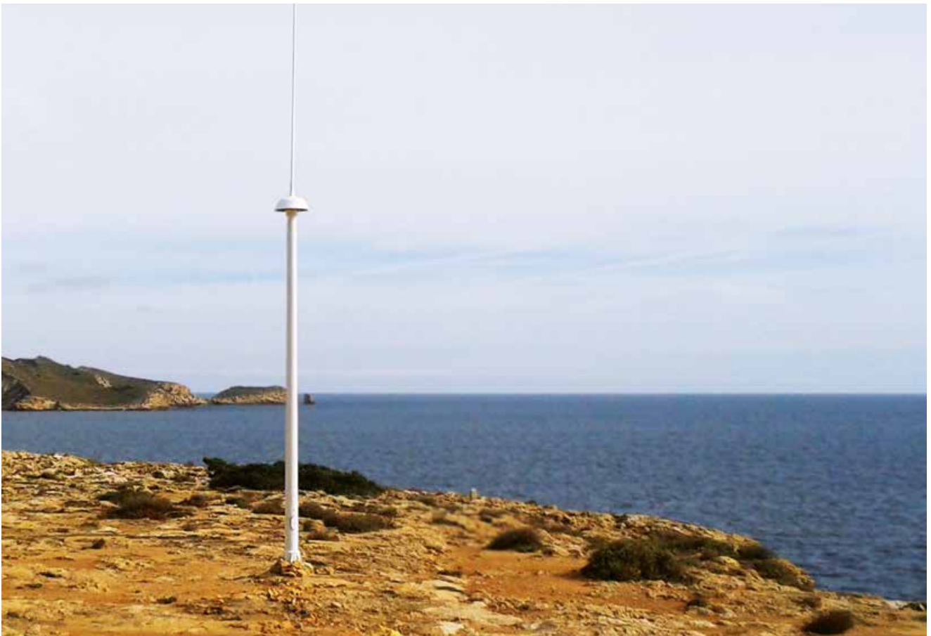
High Frequency radars collect real-time data on surface currents and waves