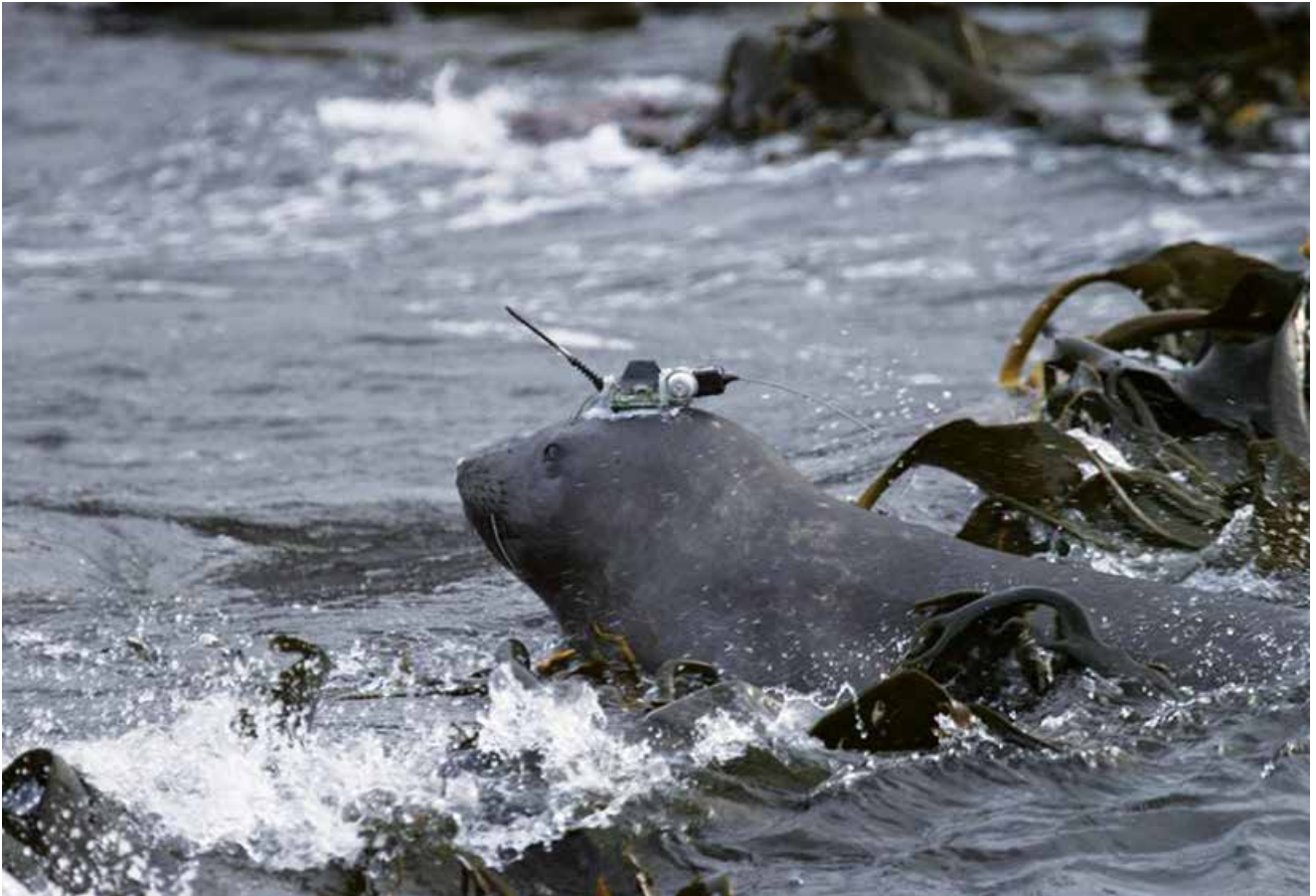
Tagged marine mammals collect data on ocean-atmosphere and physical environment, as well as the ecosystem functioning and dynamics, critical for ecosystem-based management.