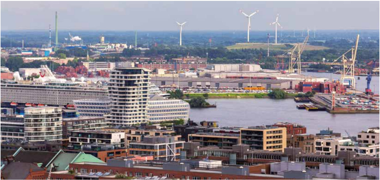
The port of Hamburg, a living example of multi-sectoral economic activities contributing to blue growth