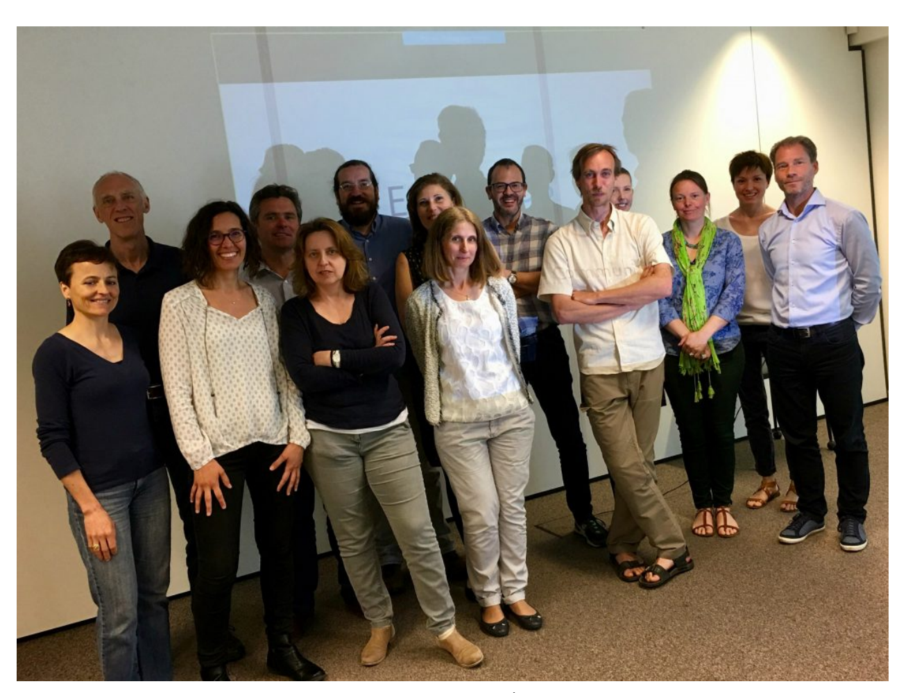
Coastal WG Kick Off Meeting, 9th May 2018, Brussels