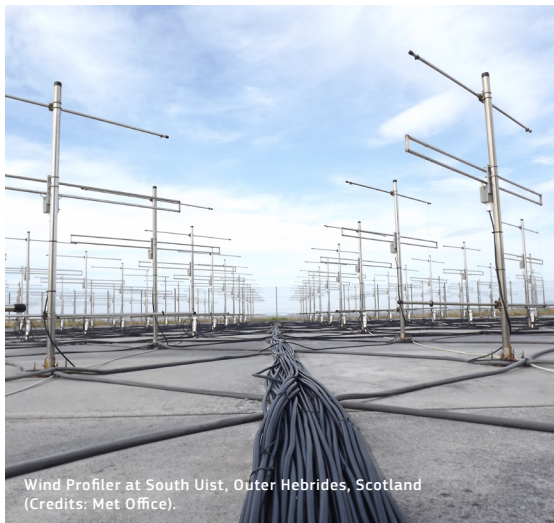
Wind Profiler at South Uist, Outer Hebrides, Scotland (Credits: Met Office).