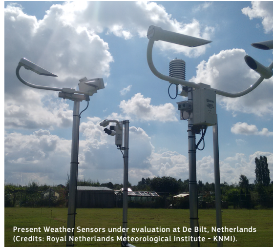
Present Weather Sensors under evaluation at De Bilt, Netherlands.

The Copernicus In Situ Component is coordinated by the European Environment Agency (EEA) under a Delegation Agreement with the European Commission, signed in December 2014. The EEA is currently working on improving the data provision to the Services and identifying data gaps and challenges.