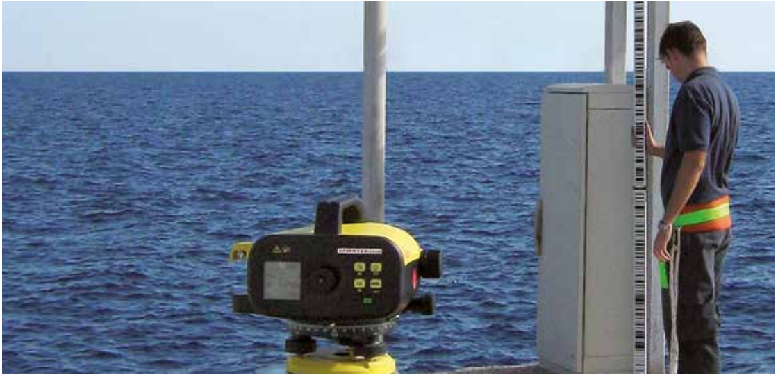
Tide gauges support harbour operations and navigation, and are important for tsunami and storm surges warnings