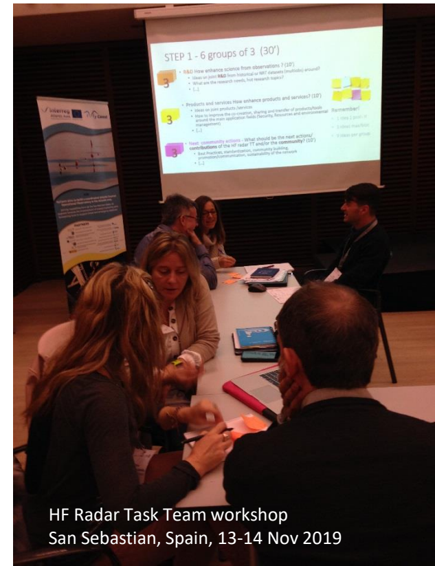
HF Radar Task Team workshop San Sebastian, Spain, 13-14 Nov 2019