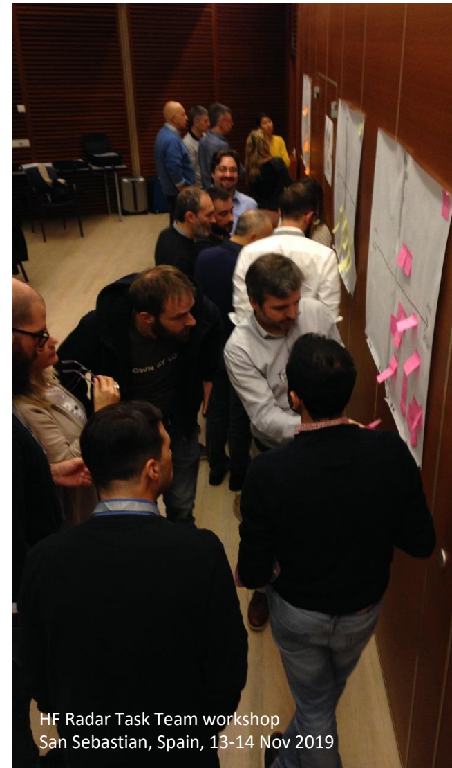
HF Radar Task Team workshop San Sebastian, Spain, 13-14 Nov 2019