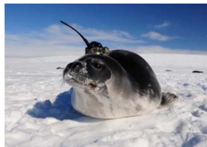
Figure 1 : Weddell seal carrying a CTD-SRDL instrument that collects temperature and salinity profiles while the animal is at sea.

Marine mammals help gather information on some of the harshest environments on the planet, through the use of miniaturized ocean sensors glued on their fur. Since 2004, hundreds of diving marine animals, mainly Antarctic and Arctic seals, have been fitted with a new generation of Argos tags developed by the Sea Mammal Research Unit of the University of St Andrews in Scotland, UK. These tags investigate the at-sea ecology of these animals while simultaneously collecting valuable oceanographic data. Some of the study species travel thousands of kilometres continuously diving to great depths (up to 2100 m). The resulting data are now freely available to the global scientific community at http://www.meop.net . Despite great progress in their reliability and data accuracy, the current generation of loggers is still unable to match standard ARGO quality specifications. Yet, improvements are underway; they involve updating the technology, implementing a more systematic phase of calibration and taking benefit of the recently acquired knowledge on the dynamical response of sensors. Together these efforts are rapidly transforming animal tagging into one of the most important sources of oceanographic data in polar eregions and in many coastal areas.